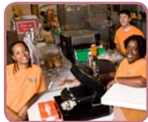
Island Hi Eatery

Two initiatives that will facilitate this revitalisation are the EEZ Small Business Loans of Working Capital and EEZ Small Business Grants of Technical Assistance . These are available in amounts of up to a maximum of $10,000 each to finance business development of existing companies or business planning for start-ups.