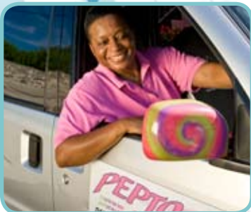
Pepto On The Run