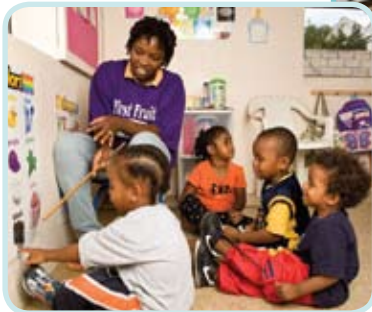
First Fruits Day Care

Under the BSBDC Act 1980, a “small business” is defined as: Bermudian-owned and managed, operating locally, having an annual gross payroll not exceeding five hundred thousand dollars ($500,000) and having annual sales revenues of less than one million dollars ($1,000,000).